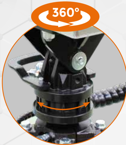
HYDRAULIC ROTATOR (OPTIONAL)