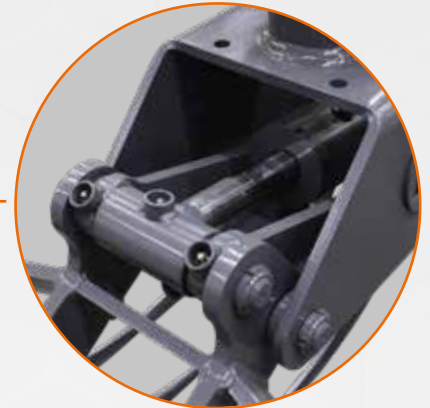
IDRAULICO HYDRAULIC JACK