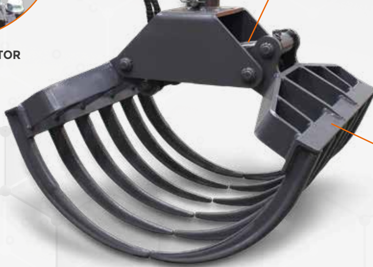
ENTIRELY BUILT IN STEEL

FORC-ONE is a clamp with horizontal cylinder for agricultural use and maintenance of green areas is suitable for the handling of manure, pruning, wooden branches and little logs. It has been designed with high yielding level pressed teeth which allow a fast and solid grip of the material.